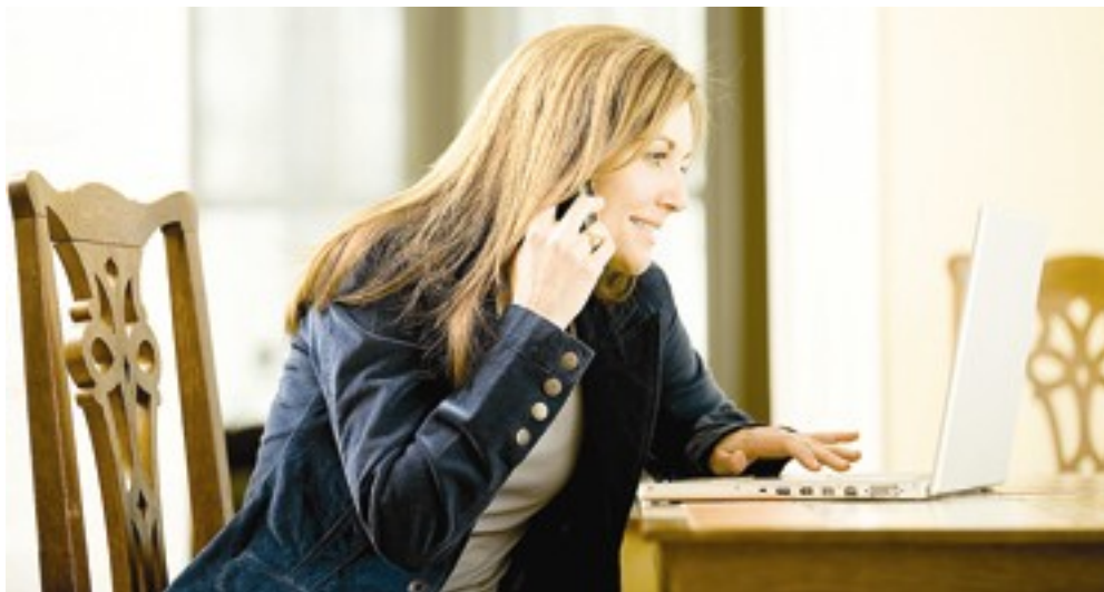
Working in front of a computer often leads to poor posture. Learn how to counteract the effects.

of lower back pain, and stiff necks and shoulders, most of which have a direct correlation to poor posture. If a person sits hunched in front of a computer screen all day, it's likely the head hovers towards the screen, the lower back has collapsed and the tail bone is supporting the weight, and legs are crossed or splayed. Bad standing posture includes the same hunching or lateral