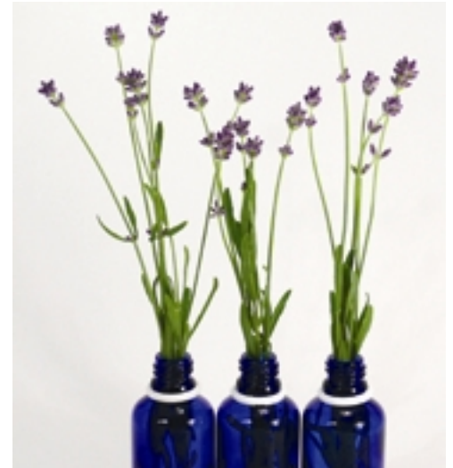
Lavender is loaded with wellness properties.

A human takes 23,040 breaths a day, and each inhale floods the system with scent. Rely on lavender's tranquil aroma to clear the way toward peaceful days.